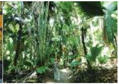
Vallee de Mai