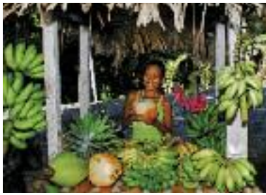
Seychellois fruit seller