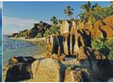
Anse Source D'Argent