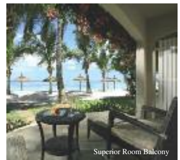
Superior Room Balcony