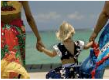
Movenpick Resort & Spa