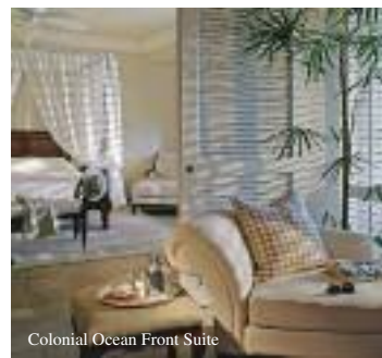
Colonial Ocean Front Suite