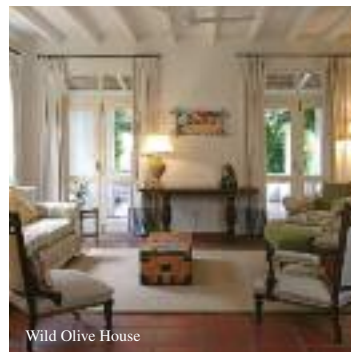
Wild Olive House

Pool - Fly fishing dam - Restaurant - Bar