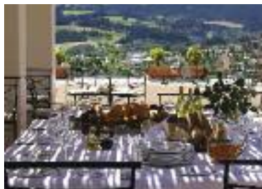
Mont Rochelle Hotel & Mountain Vineyards